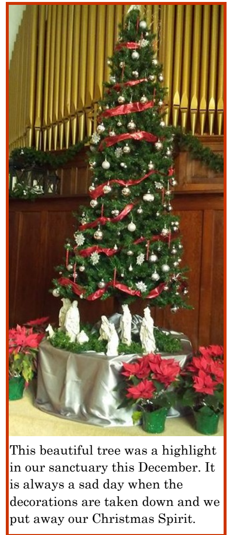
This beautiful tree was a highlight in our sanctuary this December. It is always a sad day when the decorations are taken down and we put away our Christmas Spirit.

Thank you to everyone in our congregation who participated in any way with the drug court angel tree project. Shopping, wrapping, donating money and praying for these families blessed 31 children this holiday season.