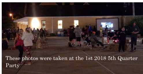
These photos were taken at the 1st 2018 5th Quarter Party