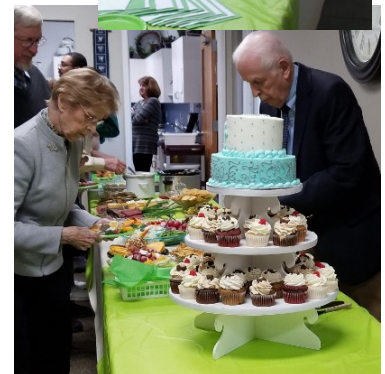
Two of our guests from Presbytery