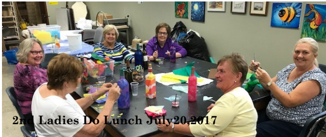
2nd Ladies Do Lunch July 20, 2017