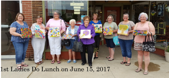
1st Ladies Do Lunch on June 15, 2017