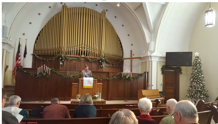
Final Communion here on New Year's Day