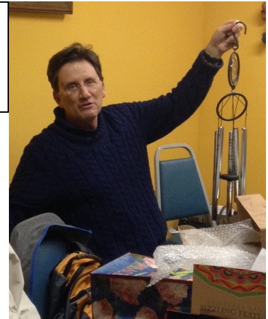
Last Session Meeting, January 24th

I have placed before you an open door that no one can shut. (Revelation 3:8) Not knowing when the dawn will come I open every door. (Emily Dickenson) Quote from final "Out of the Saltshaker"