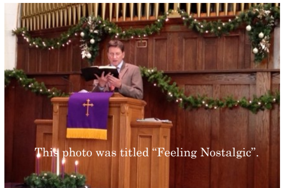
This photo was titled "Feeling Nostalgic".

Meriwether's new address: 350 Arcadia Court, Fort Wayne IN 46807