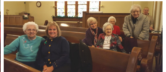
Photos of some of those in attendance, after the music enjoying fellowship and food together.